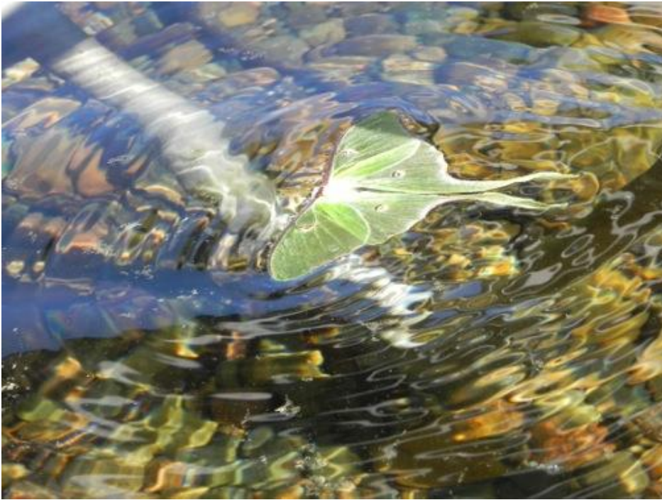
Photograph and Painting courtesy of Sheila Currie

The lake association is sponsoring a Wildlife and Habitat Photo Contest this year. Get your cameras out and capture the beautiful and unique things that we see around Big Basswood. We are looking for all sorts of photos of the wildlife and habitat that surround Big basswood Lake. Things that we all see. For ideas, check out the Wildlife and Habitat Inventory page at www.bigbasswood.ca/forum.php