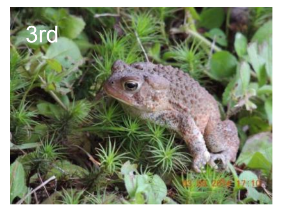
TOAD by Shannon Loutit "Up close and personal"