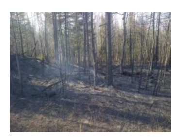
Do your part to help prevent forest fires

http://www.mcscs.jus.gov.on.ca/ english/FireMarshal/ FireSafetyandPublicEducation/ PublicFireSafetyInformation/ CottageFireSafety/ OFM_cottage_fire_safety_tips.html