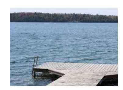
Basswood Lake in the spring

in order to "flush" Bright Lake. As many of you know Bright Lake has