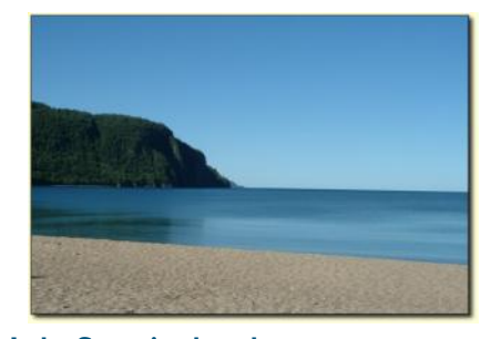
Lake Superior beach